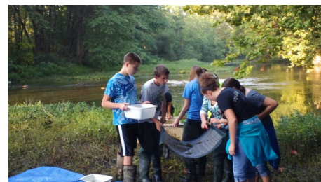
Students collect macro-invertebrates from the stream.