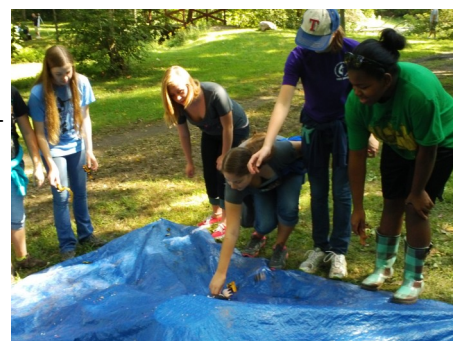
Students learn about erosion.