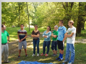
Students listen to a volunteer from Wildcat Guardian organization.

activities during the Wildcat Experience. The focus was on water quality, local wildlife, our local watershed, and the wildcat creek. The experts provided a lunch and then students went back out for afternoon activities. Everyone learned how important taking care of our local environment was and had a great day outdoors.