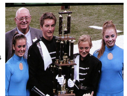
State Marching Band winning drum majors and guard captains accepting