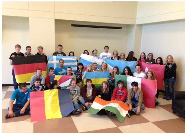
Students from the sixth period Japanese, French, and Spanish classes that participated in the World Language Olympics on October 8, 2012.

Overall, students were successful in completing World Language State Standard 8 for their individual language classes by using knowledge of languages and cultures for personal enrichment.