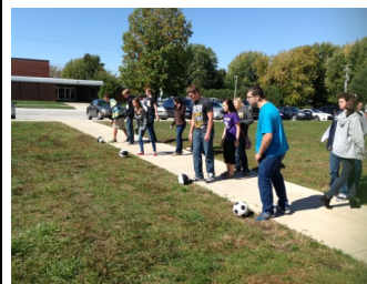
World language students wait for the start of the soccer relay during WILD Olympics

"An education system isn't worth a great deal if it teaches young people how to make a living and doesn't teach them how to live." - (Author unknown)