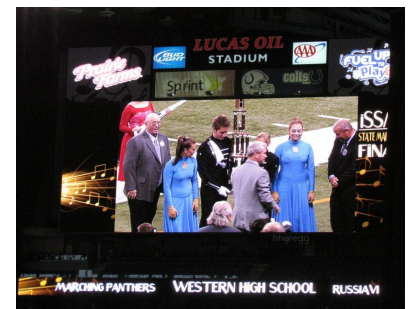
Band members accepting State Marching Band trophy.

Some adults remember only bits and pieces of their high school years. Hopefully, the students will be able to use a great deal of their experience as they live their adult lives.