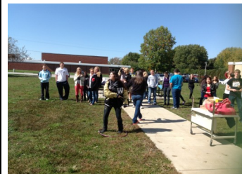
WILD classes participate in the tortilla toss during World Language Olympics

"An education system isn't worth a great deal if it teaches young people how to make a living and doesn't teach them how to live." - (Author unknown)