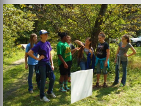
Students discover that different animals can be found along Wildcat Creek.